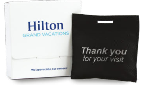
Hilton - Grand Vacations Scented sachet

One&Only - Le Saint Géran Scented sachet