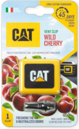
Car Air Freshener Wild Cherry