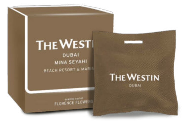
The Westin Dubai Scented sachet