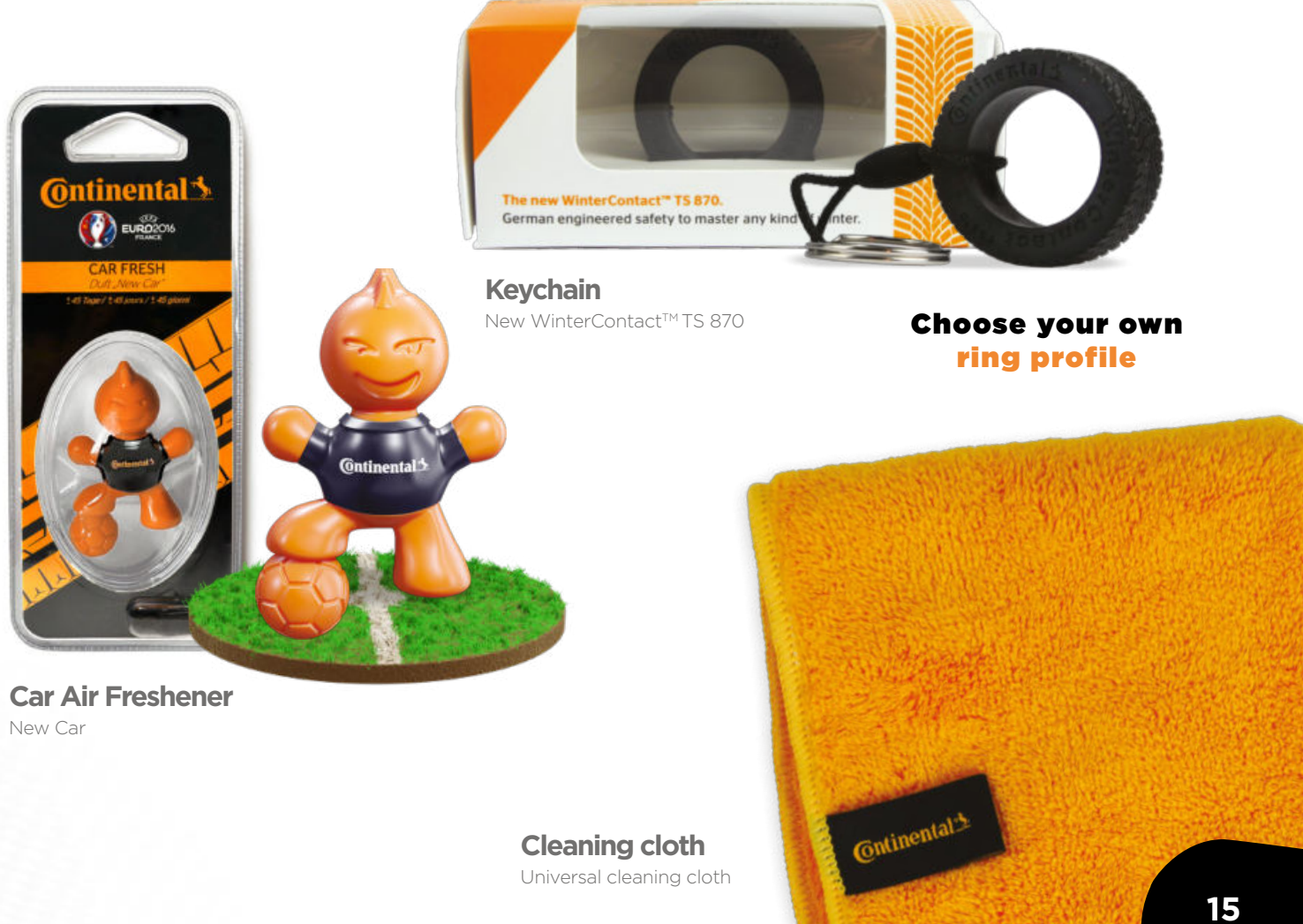
Car Air Freshener SportContact™ 6