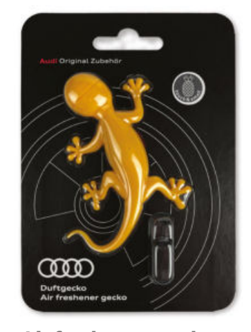
Air freshener gecko Passion - Yellow