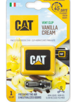
Car Air Freshener Vanilla Cream