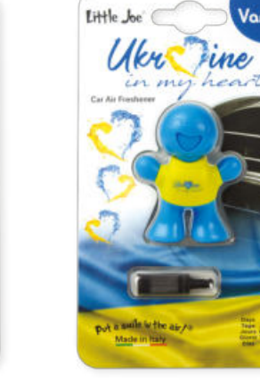
Ukraine in my heart