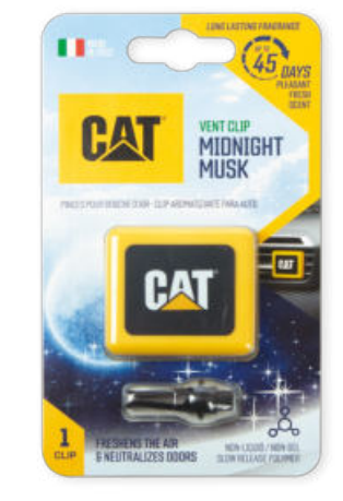
Car Air Freshener Midnight Musk